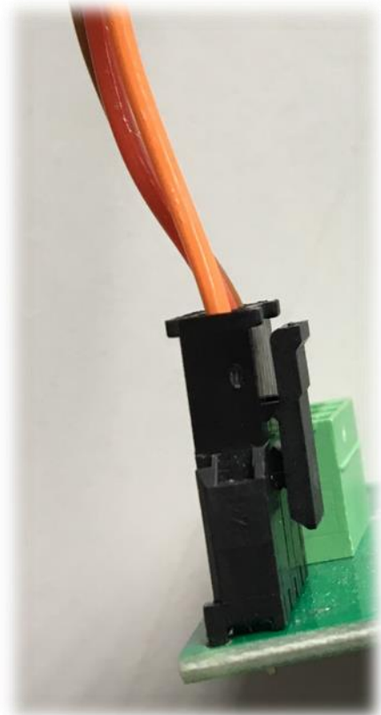
Fig. 3 SC2 connection to Basic Sensor Board