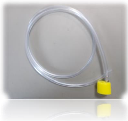
Fig. 2 Calibration adapter C2Z4